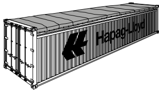
40' OPEN TOP