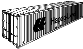
40' HIGH CUBE HARD TOP