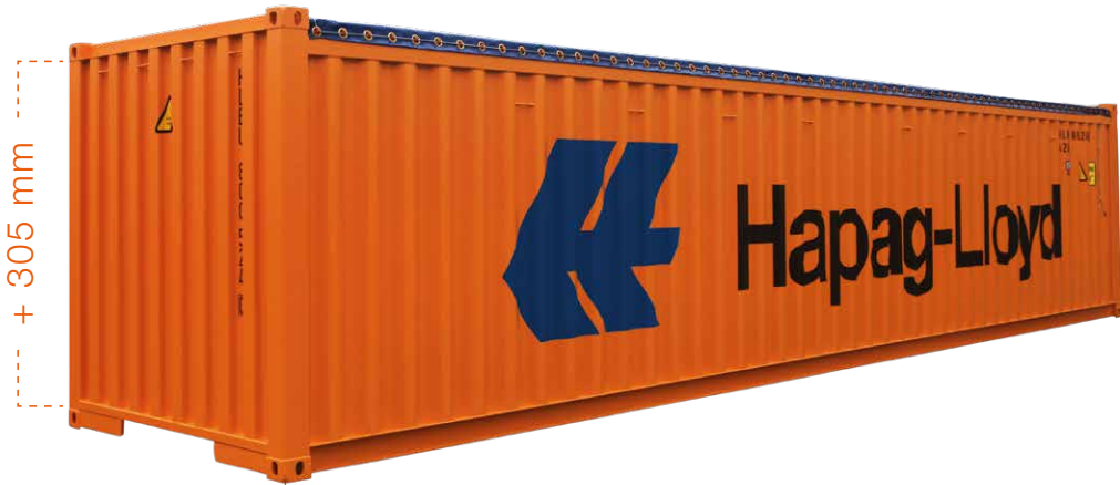
40' HIGH CUBE OPEN TOP

Being the only provider of a 40' High Cube Open Top Container equipped with the Steel Floor technology, we can offer our customers another individual container type with additional loading height, innovative floor material and a higher point load.